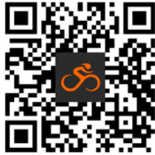
20 Mile Route